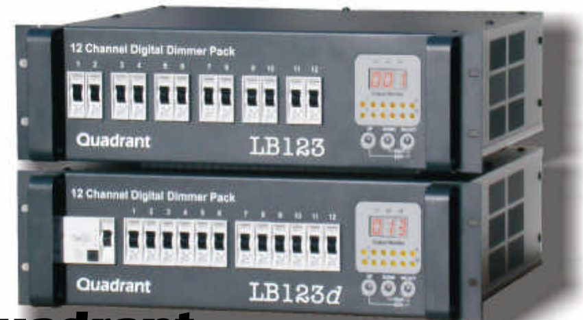
Quadrant – Digital Dimmer Pack

Leid - Equipamento Electroacústico Iluminação e Domótica Lda.